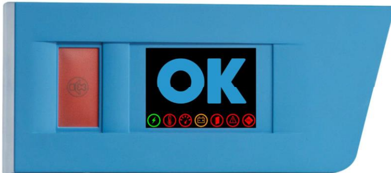
Status display "OK"