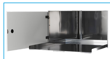
Pull-out shelf, tilt protected

Stainless steel frame with fixed shelves