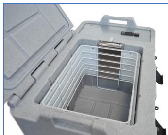
with protective grille

Easily accessible due to the wide opening - insulated lid. Inner-shell made of one piece, with rounded corners, made of aluminium coated white colour. Wire netting basket (to insert) for easy and quick removal and transport of the cooled items.