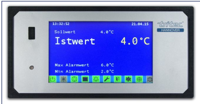
Language in German / English adjustable

Touchscreen temperature controller, TC 2015